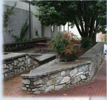
"Mini-park" to be refurbished

On January 4, 2010, the Waynesville Public Art Commission issued a call to all professional artists, residing in both North Carolina and Tennessee, for its 4th public art project for Waynesville.